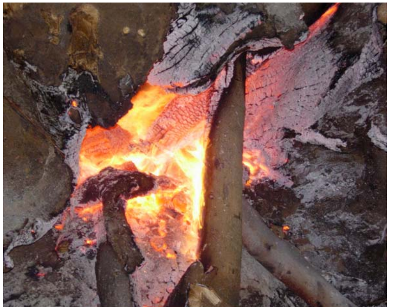
Victor Mwakalombe, Fire.