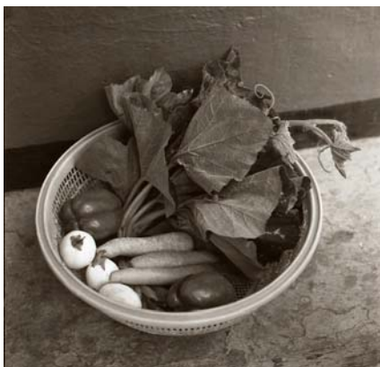
Trudy Kapapula, Kitchen.