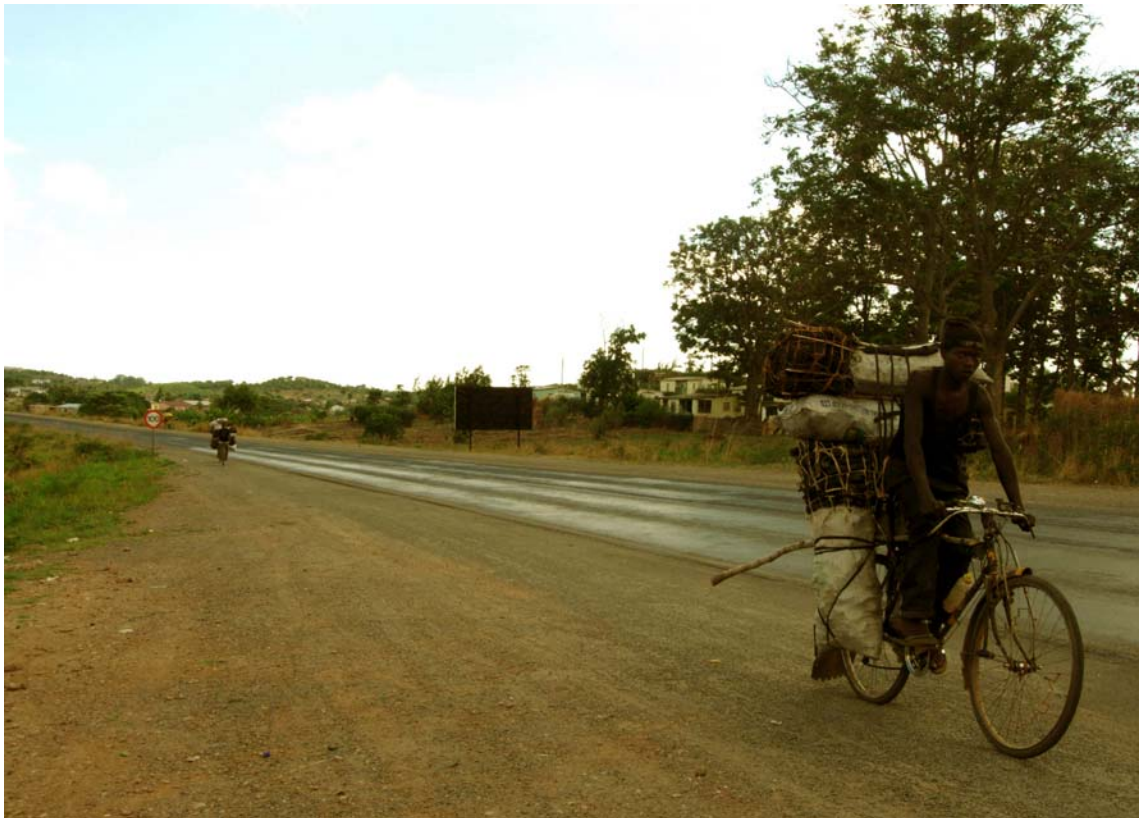
Syakwasia, Man on a bicycle.