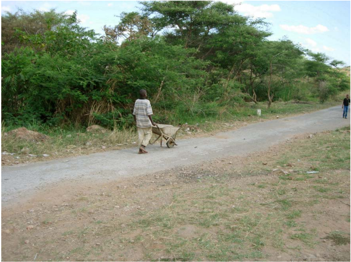
Gift Syakwasia, Kamugaiz na wilibala.