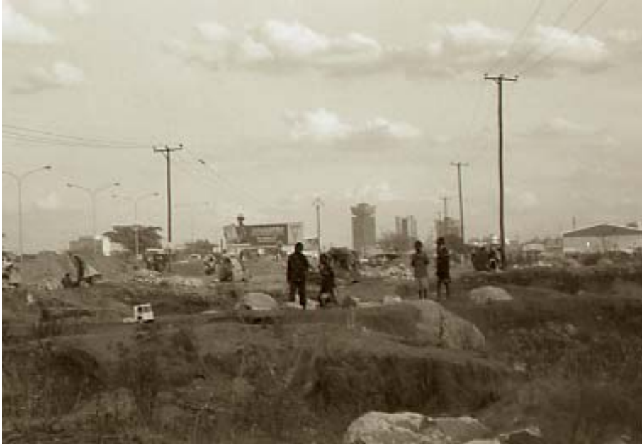
Nsofwa Bowa, Defiled Land.