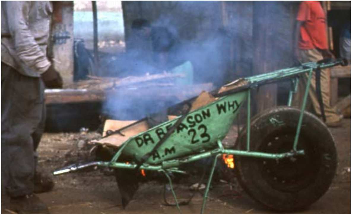
Nezias Nyirenda, Market 2.