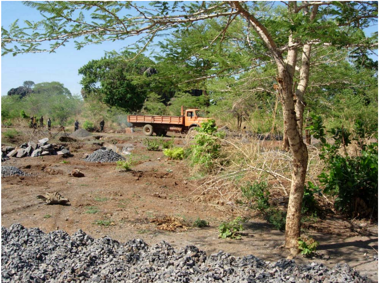
Emmanuel Kapote Stones 7.

The exhibition was an essential outcome of the workshop. It also provided an opportunity to reflect publicly upon the ways in which photography might be exploited by the visual arts community.