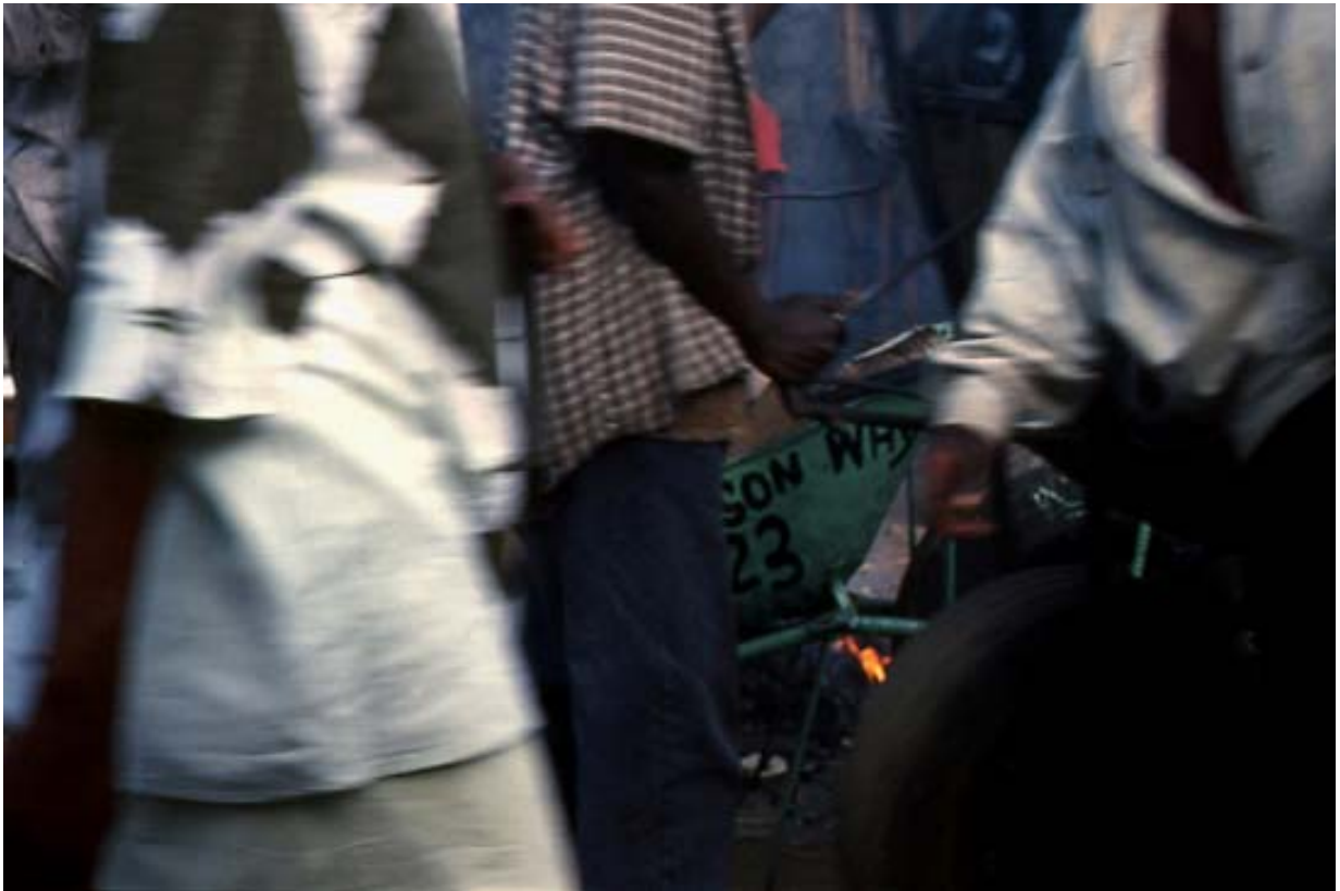
Nezias Nyirenda, Market 3.