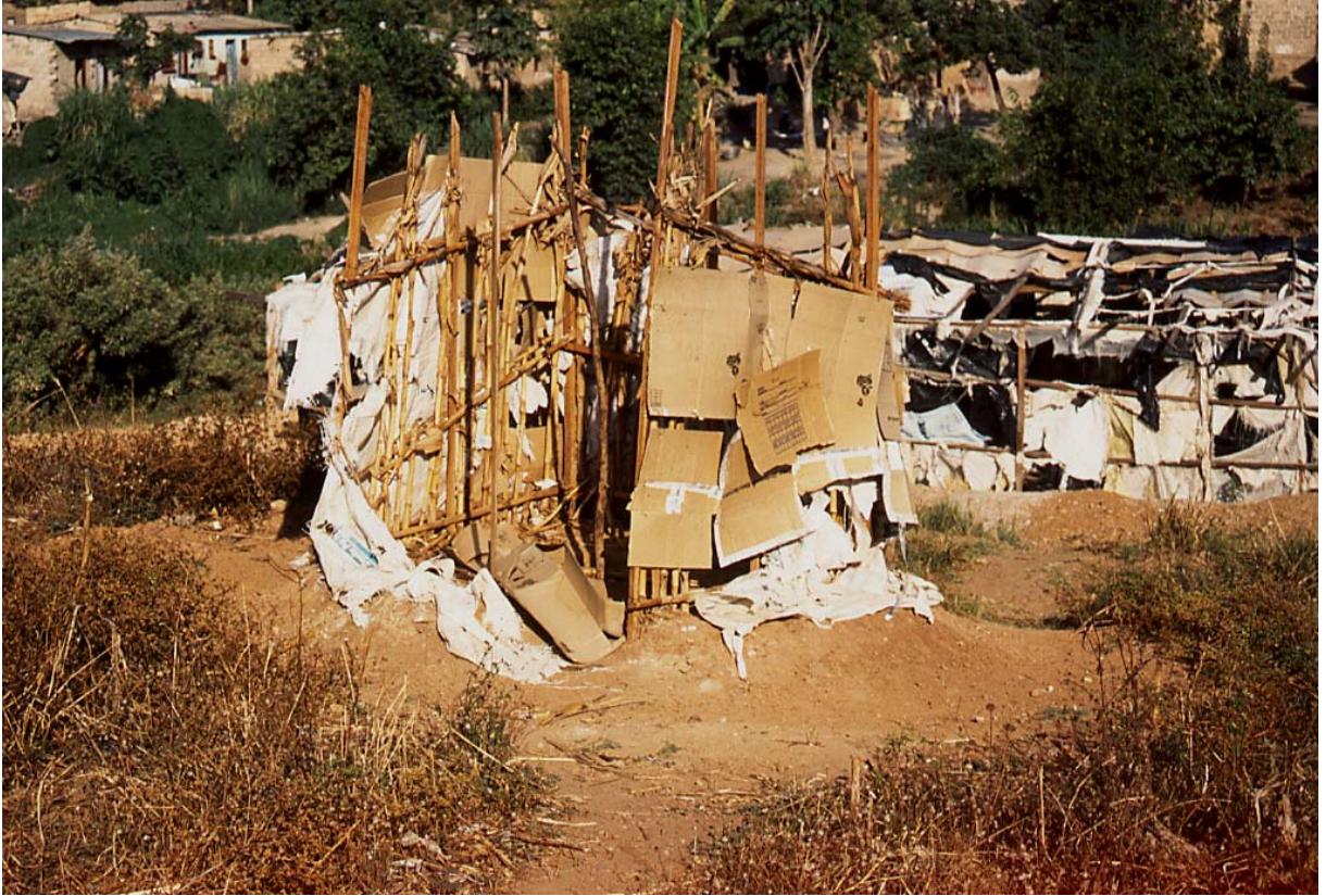
Saviour Mukopa, Church Toilet.