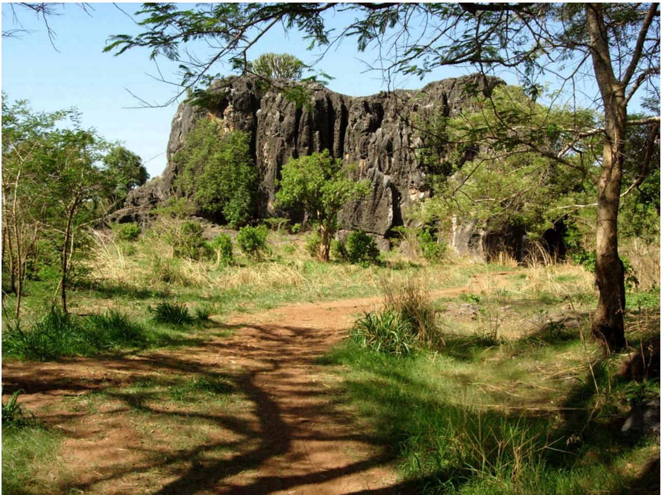
Emmanuel Kapote, Landscape 8.