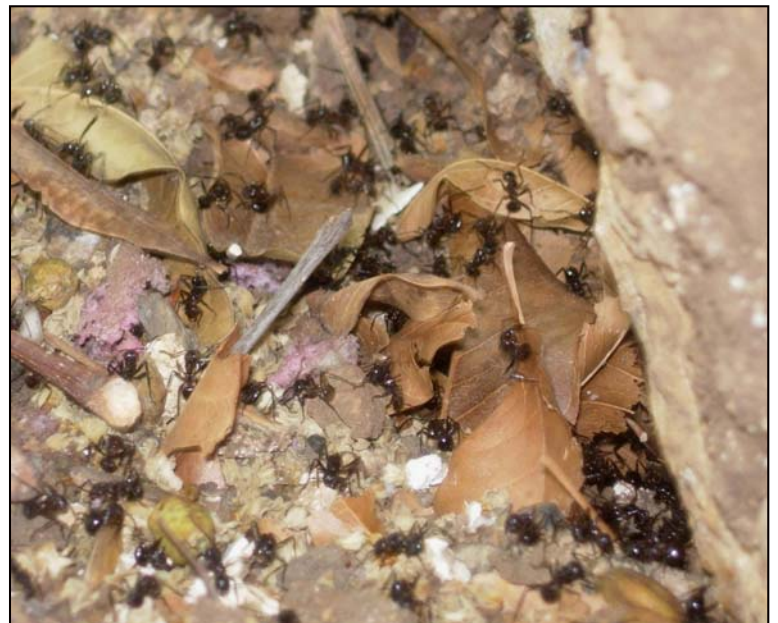
Saviour Mukopa, Nyelele.