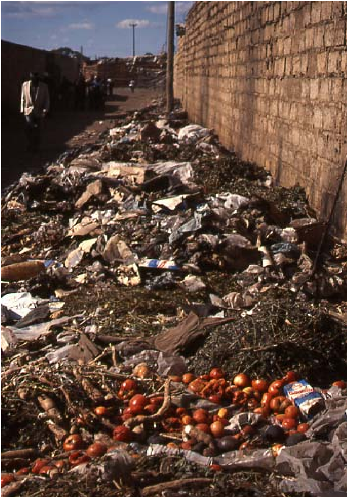
Nezias Nyirenda, Soweto garbage.