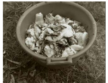
Trudy Kapapula, Waste